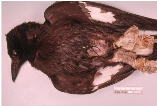
Fig 1. Pied currawong with gross lesions.

Internal findings: No significant findings.